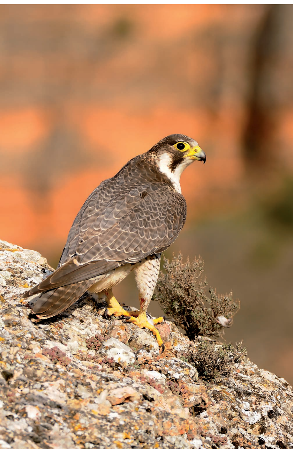
Peregrine Falcon Falco peregrinus